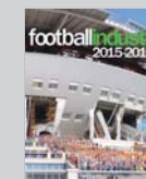
Каталог Футбольная индустрия