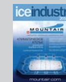
Каталог Ледовая индустрия