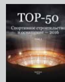
Каталог TOP-50 Спортивное строительство и оснащение