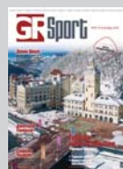
Журнал GR Sport