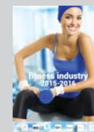
Каталог Фитнес индустрия