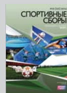
Журнал Спортивные сборы