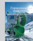
Каталог Горнолыжная индустрия